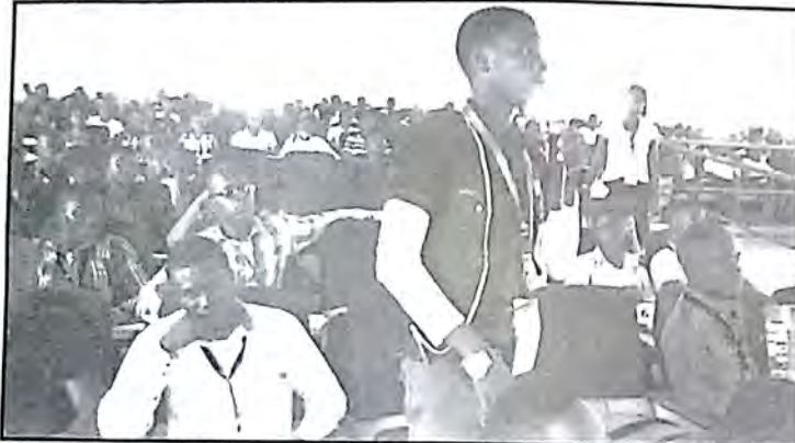
A cross section of youths at the Foundation Conference organized by Centre For Social Awareness, Advocacy and Ethics in Owerri recently.