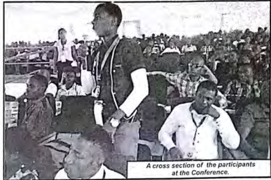
A cross section of the participants at the Conference.

He said as long as he was alive, he had a right to decide which of his children would inherit his property.